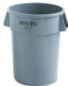
Grey or Black Bin